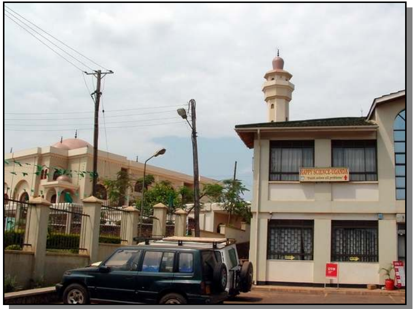
A mosque located next to the Festival office