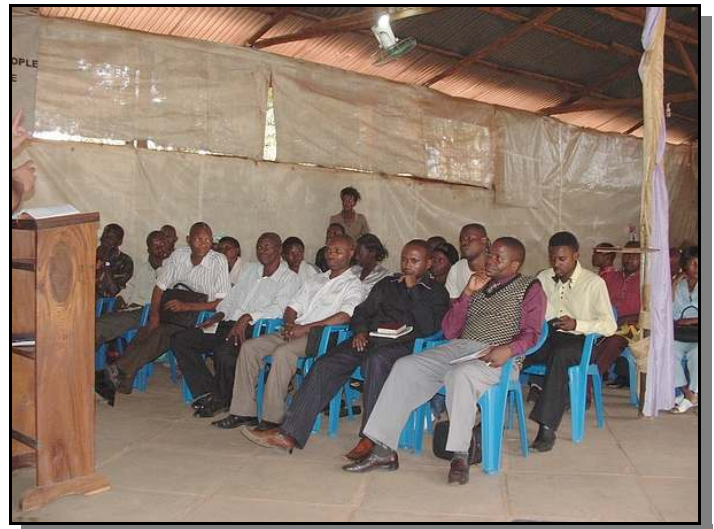
A training class in Kampala