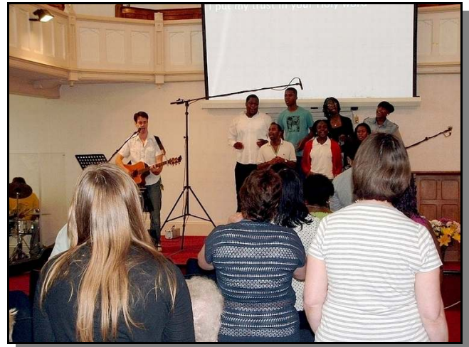
Congregation & music group at Manor Park Christian Center Sunday service